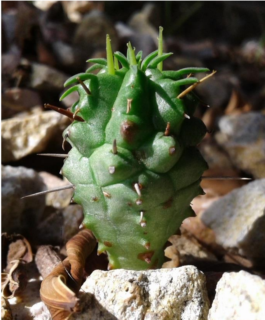
Euphorbia stellaspina x pubiglans , hybridized by Andrew Lander, killed by sewage line workers