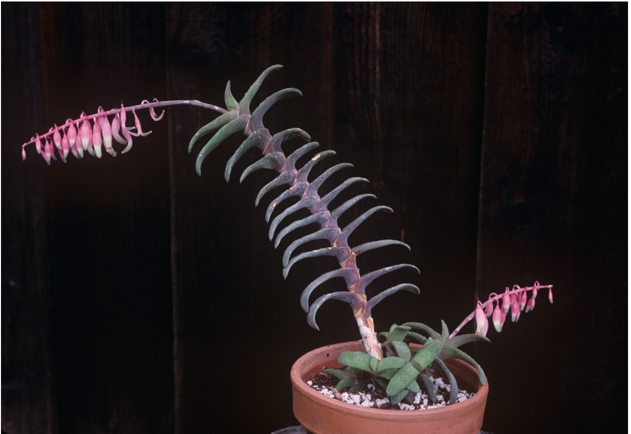
Gasteria rawlinsonii

Newsletter of the Long Beach Cactus Club Founded 1933; Affiliate of the Cactus and Succulent Society of America, Inc.