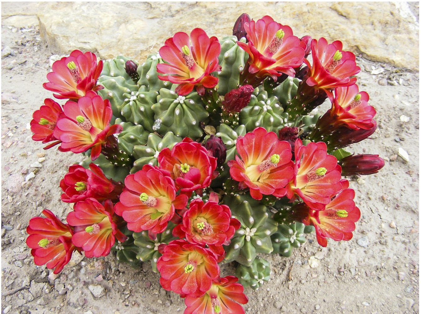
Echinocereus mojavensis fma. inermis