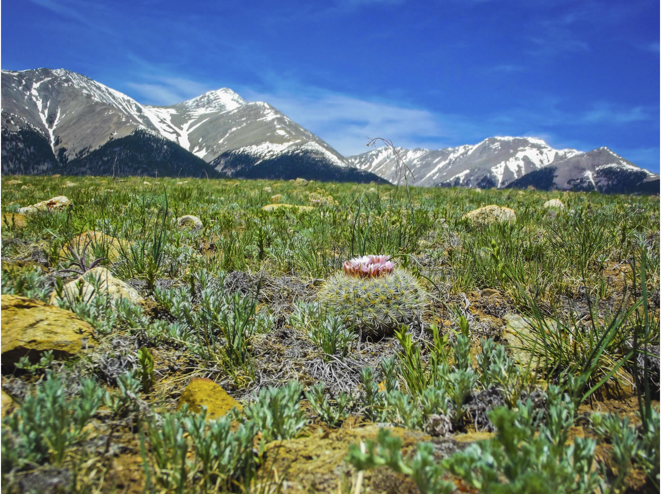
Pediocactus

Newsletter of the Long Beach Cactus Club Founded 1933; Affiliate of the Cactus and Succulent Society of America, Inc.