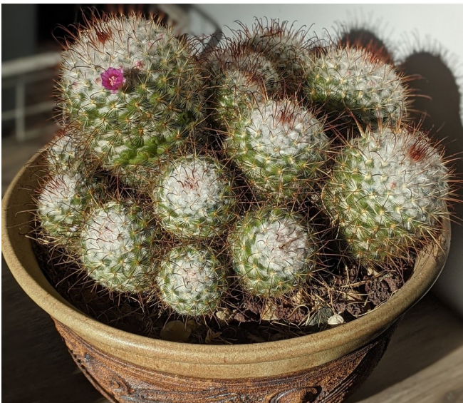
3rd Place Beginners: Crystal Eckman's Mammillaria bombycina