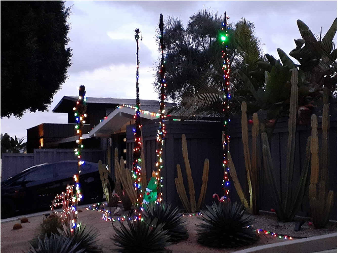
Agave inflorescences decorated for Christmas

Newsletter of the Long Beach Cactus Club Founded 1933; Affiliate of the Cactus and Succulent Society of America, Inc.