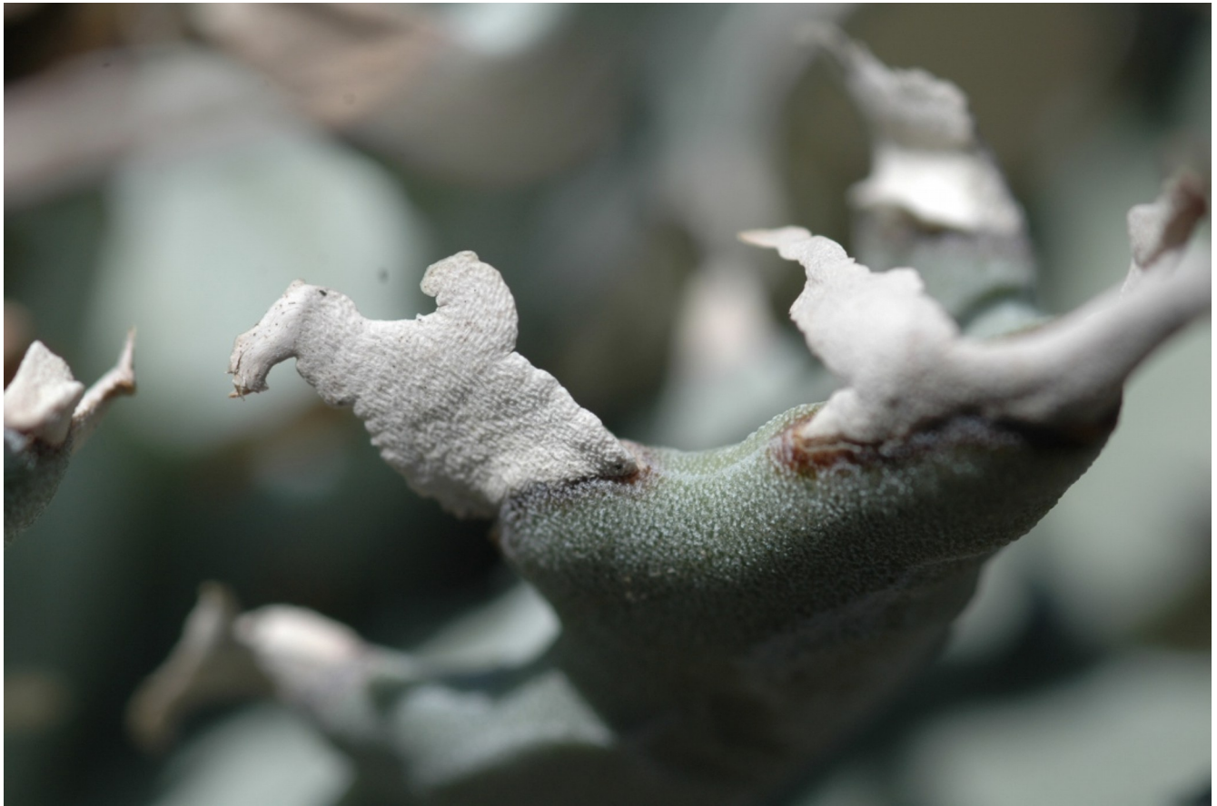
Agave utahensis