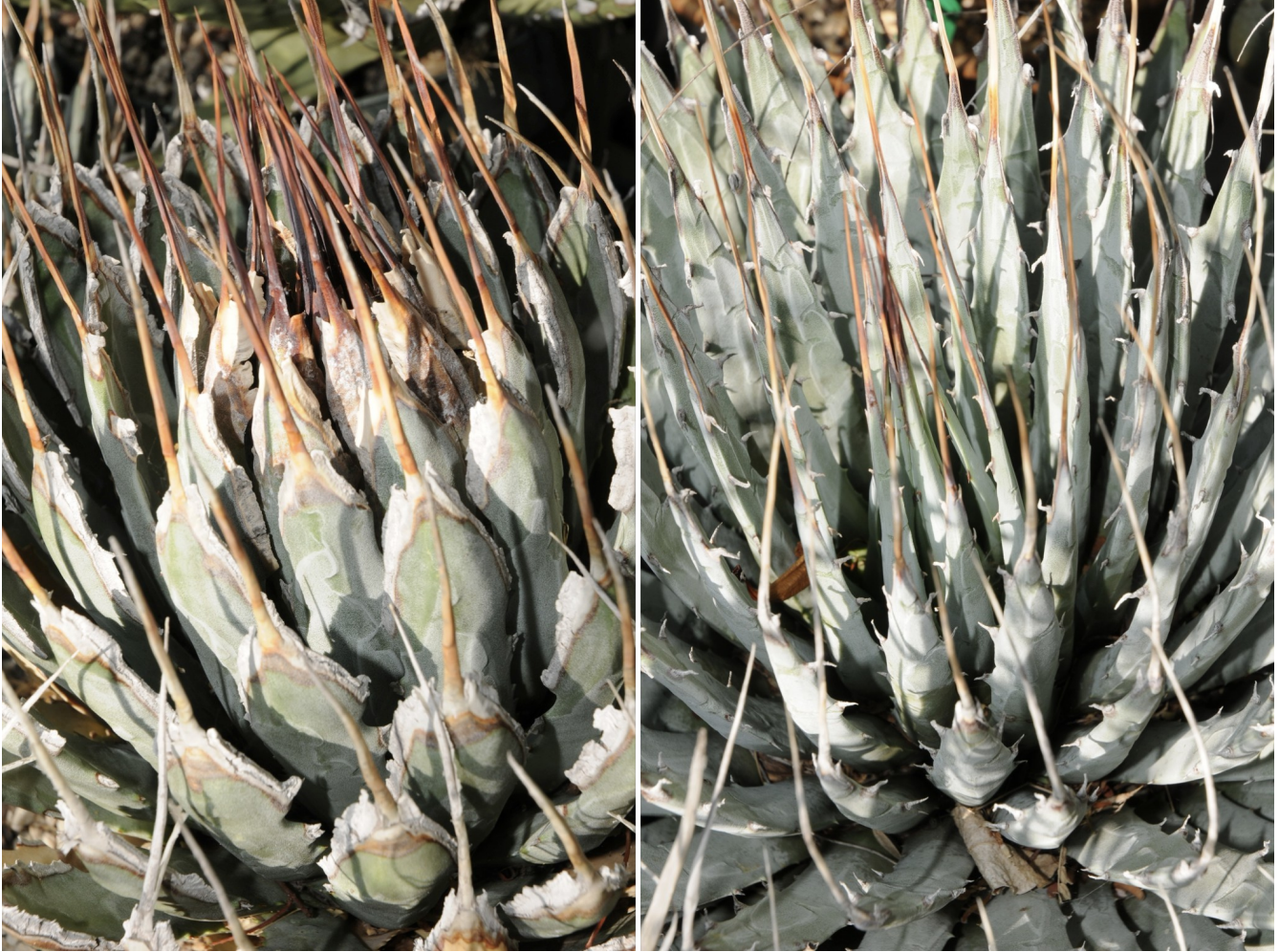
Two varieties of Agave utahensis

Newsletter of the Long Beach Cactus Club Founded 1933; Affiliate of the Cactus and Succulent Society of America, Inc.