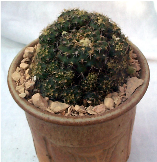
Frailea grahliana in a 3 inch pot

Epithelantha micromeris a variable species from Texas and Northern Mexico.