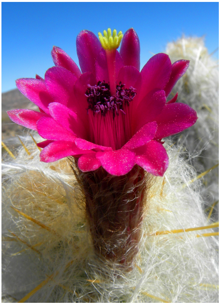
Oreocereus luecotrichos, photo by Woody Minnich