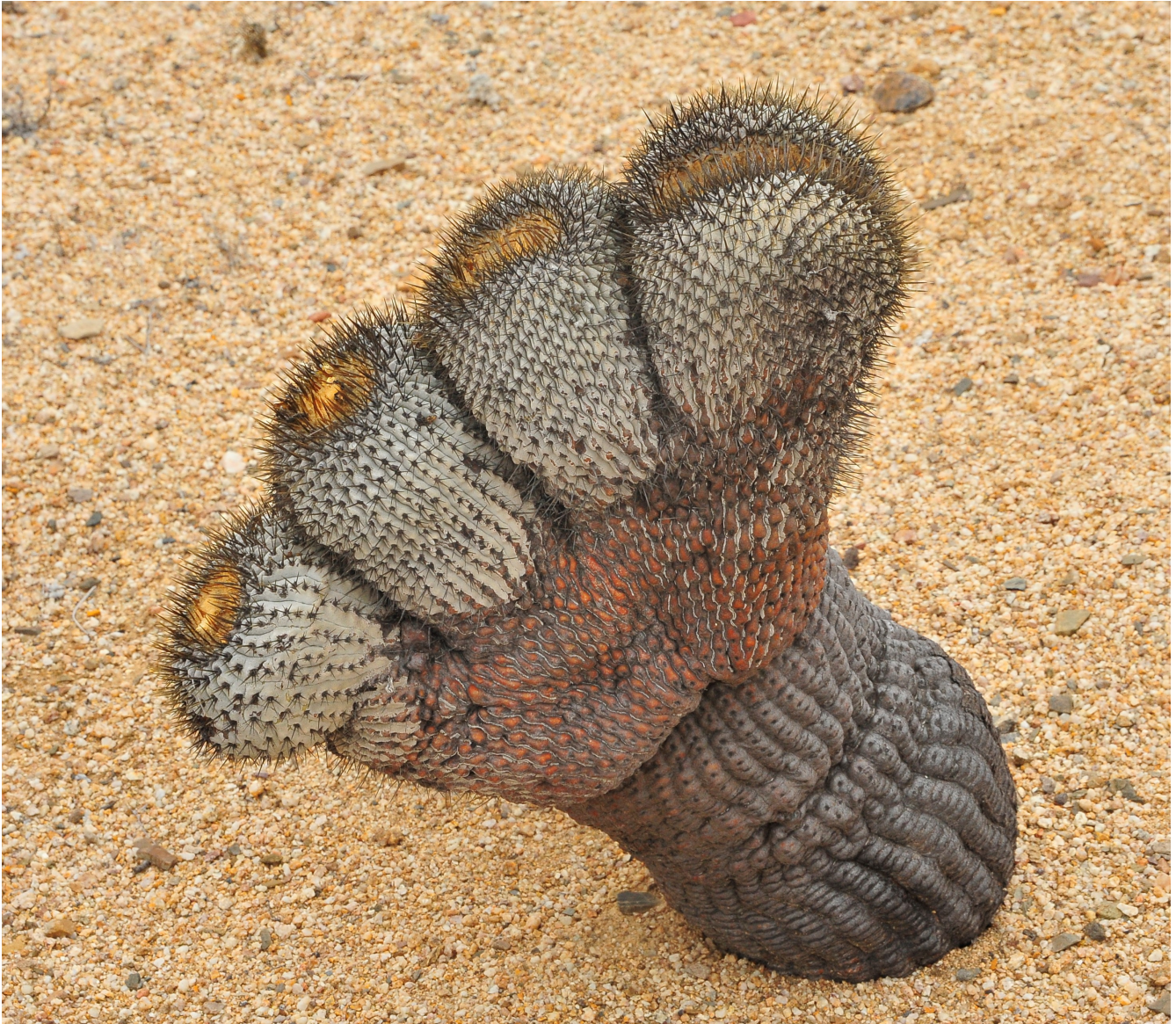
Copiapoa columna alba crest at Pan de Azucar

Newsletter of the Long Beach Cactus Club Founded 1933; Affiliate of the Cactus and Succulent Society of America, Inc.