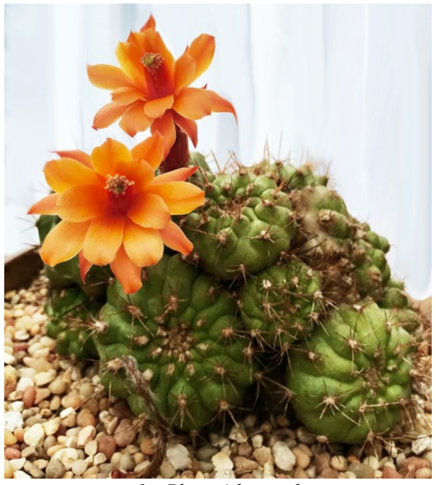
1st Place Advanced