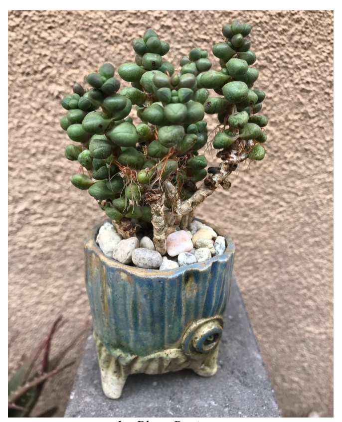
1st Place Beginner