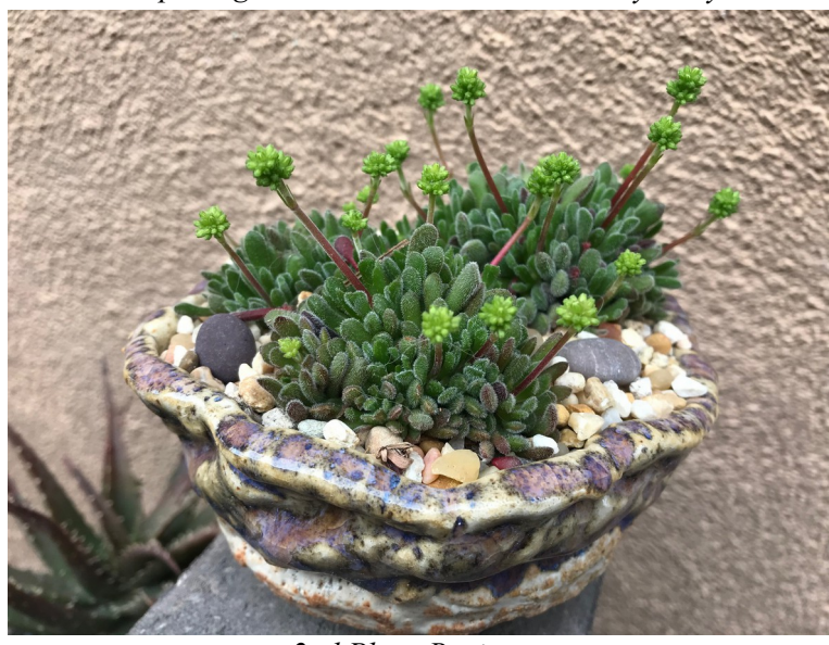
2nd Place Beginner