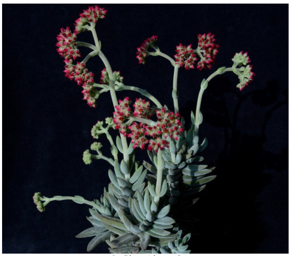
1st Place Advanced