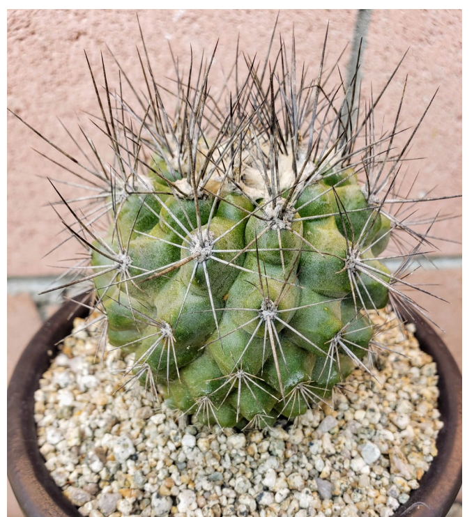
1st Place Beginner