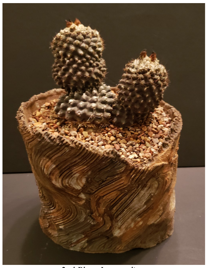
2nd Place Intermediate