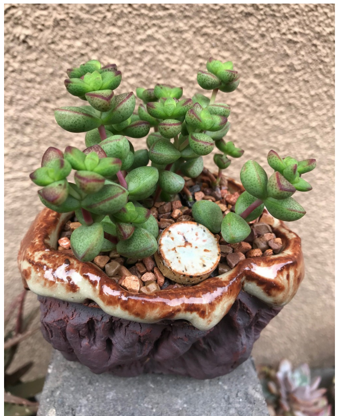
3rd Place Beginner