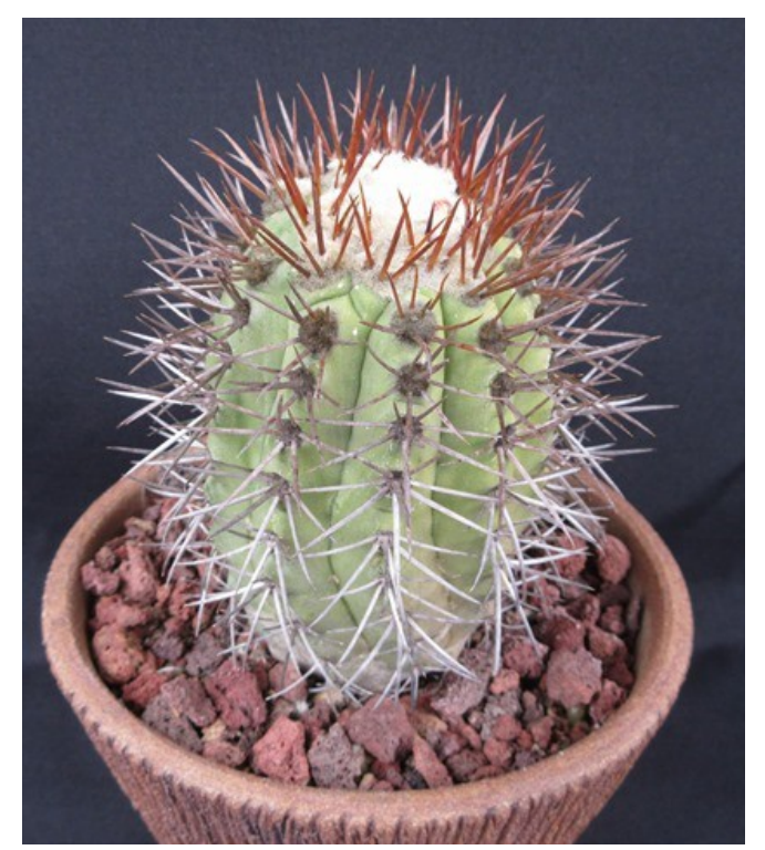
3rd Place Intermediate