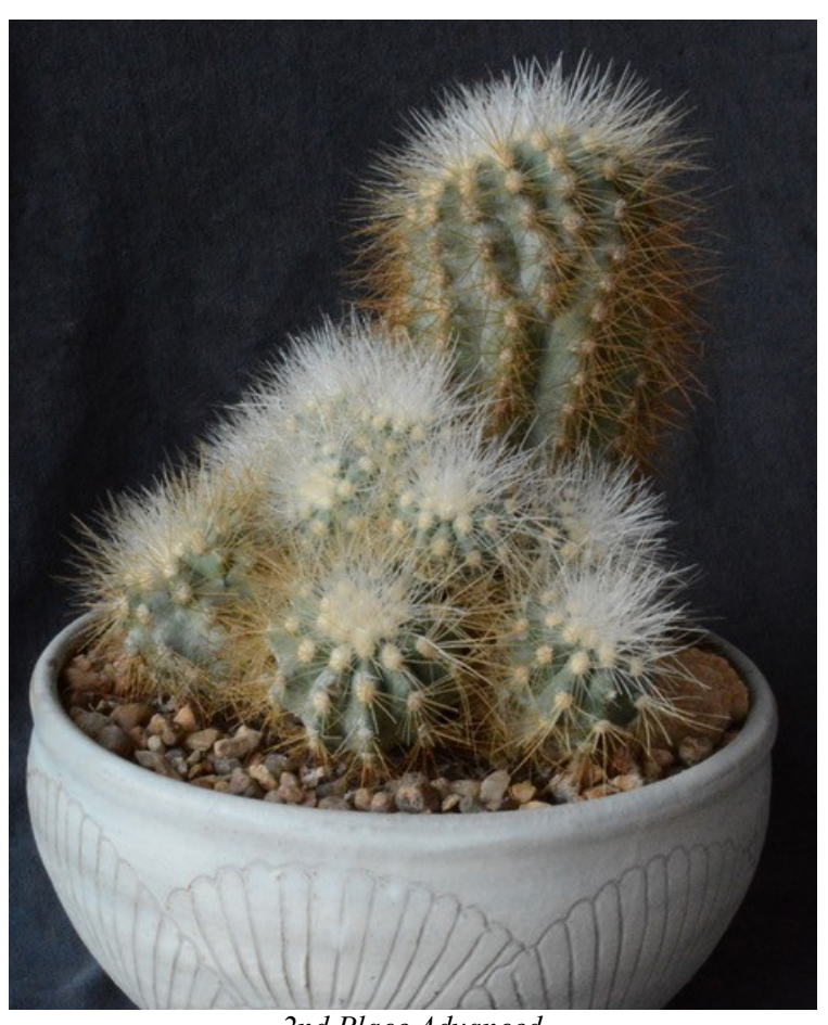
2nd Place Advanced