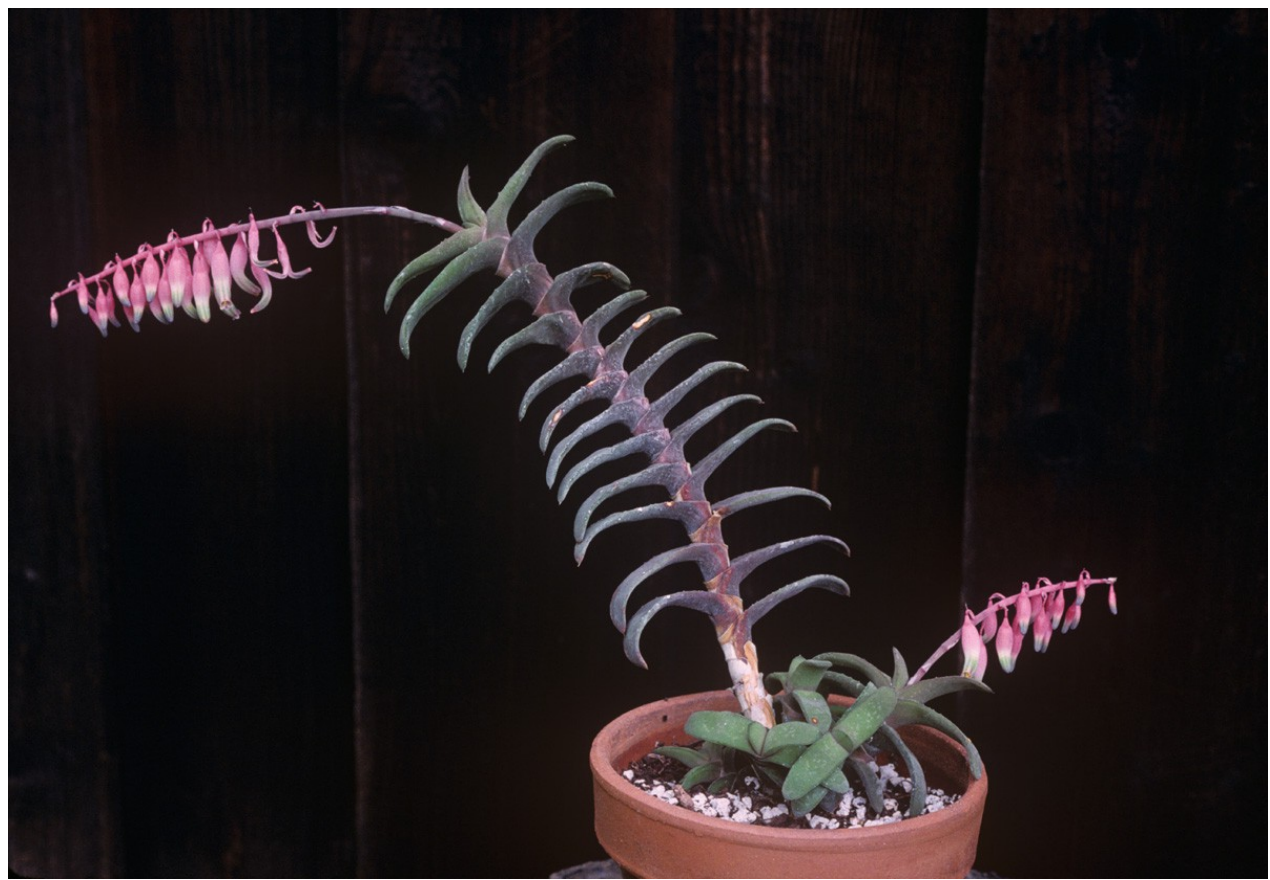
Gasteria rawlinsonii

Newsletter of the Long Beach Cactus Club Founded 1933; Affiliate of the Cactus and Succulent Society of America, Inc.