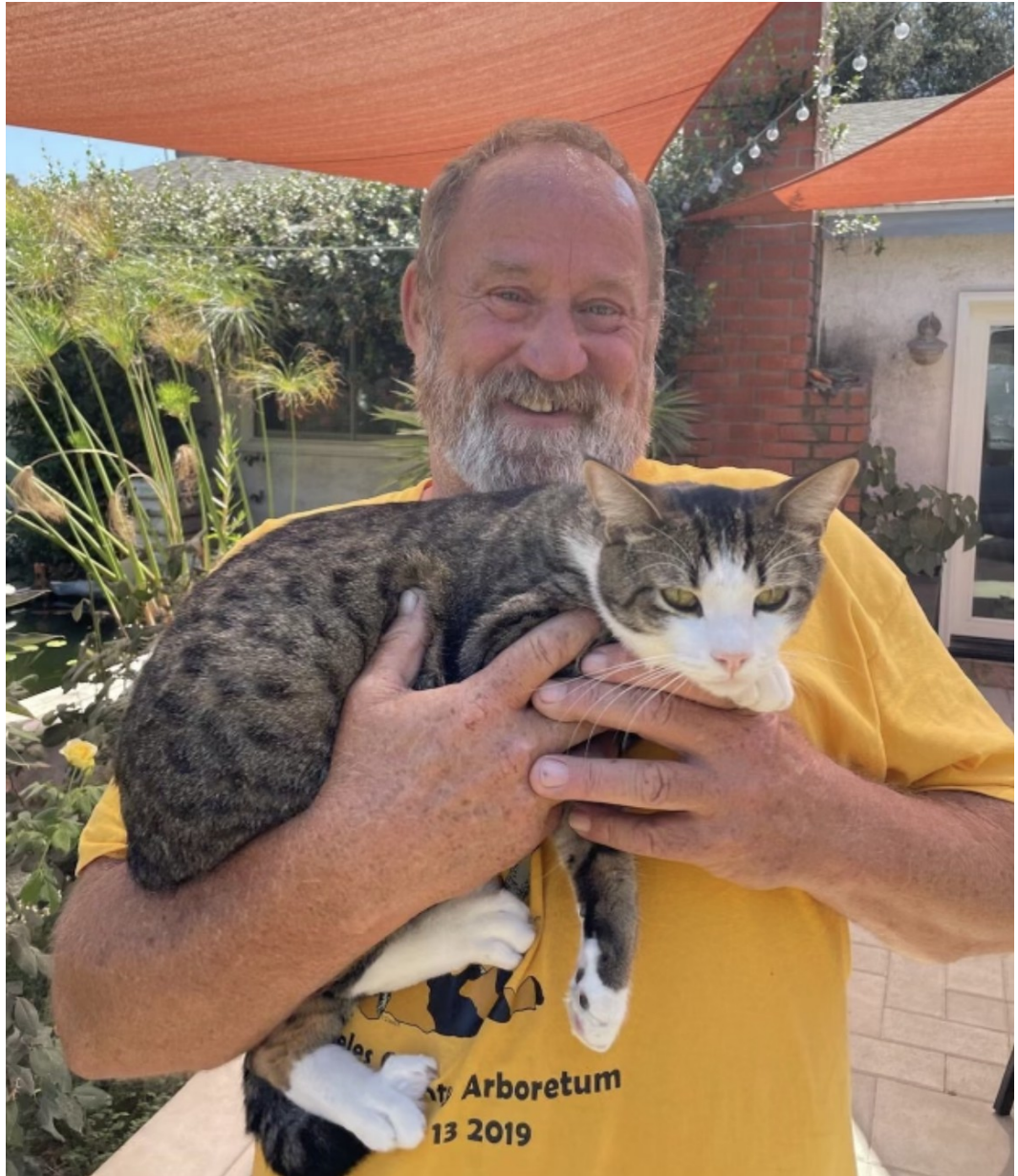
This is NOT a cactus. Do NOT hot nail it under ANY circumstances.

The program I will be presenting is filled with graphic and violent behaviors. The plants used in my demonstrations will recover from being bisected, decapitated, and hot nailed. The concept of this presentation is to demonstrate the resilience of the succulent plants we all grow and to encourage people to play with their plants.